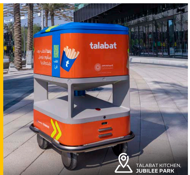
TALABAT KITCHEN, JUBILEE PARK

The two-storey food hall not only offers some 30 food concepts but also uses cutting-edge technology and robotics to deliver an efficient dining experience.