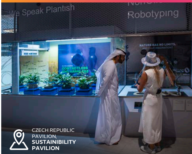
CZECH REPUBLIC PAVILION, SUSTAINABILITY PAVILION

State-of-art phenotyping technology developed by PSI provides plant scientists around the globe with effective tools to determine how plants are feeling and what they need! This smart technology allows us to understand the subtle but fascinating language of plants by translating it into a format readable by humans. You have the opportunity to understand the PLANTISH language too. Welcome to the fascinating world of plants!