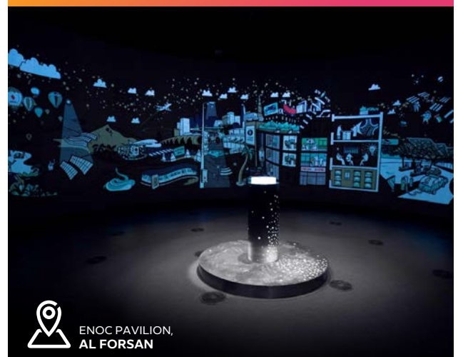
ENOC PAVILION, AL FORSAN

Designed to take visitors on an inspiring and immersive 15-minutes journey to challenge the conventional understanding of energy, ENOC Pavilion offers inspiring insights on how we can all partner in shaping the future of energy. It is a first-of-its-kind journey, visitors can 'feel' the energy through the use of ultrasound, audio-visual narratives, sensory experiences, kinetic installations and interactive projections. The architectural theme of the pavilion draws on the design of oil storage tanks with five distinct structures.